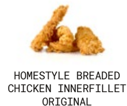
HOMESTYLE BREADED CHICKEN INNERFILLET ORIGINAL

WE OFFER A WHOLE RANGE OF SOUS VIDE BURGERS