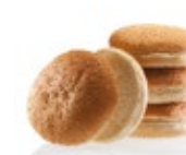
MEGA BURGER BUN 12CM