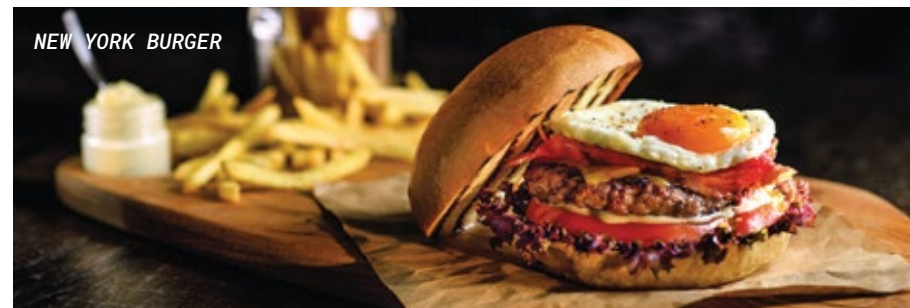
NEW YORK BURGER