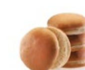
BURGER BUN MINI 10CM