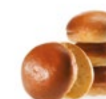
BURGER BUN BRIOCHE BUTTER 12 CM