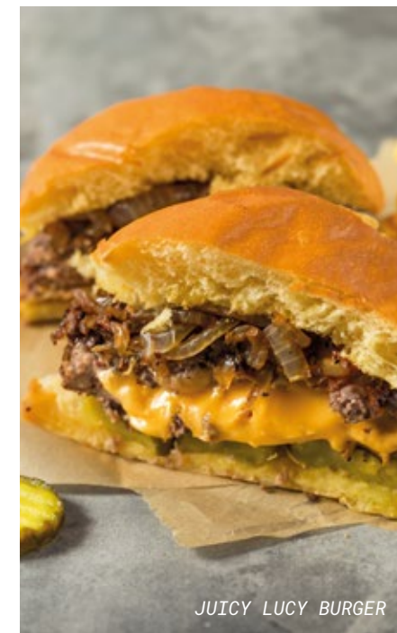
JUICY LUCY BURGER

A definitely convenient and reliable solution for a fixed result. Create within just few minutes, burgers that will surprise your audience!