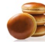
BURGER BUN BRIOCHE 12 CM