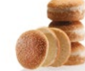
BURGER BUN DOUBLE TOWER 10CM