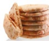
KNEADED BREAD "LAVAS" 20CM