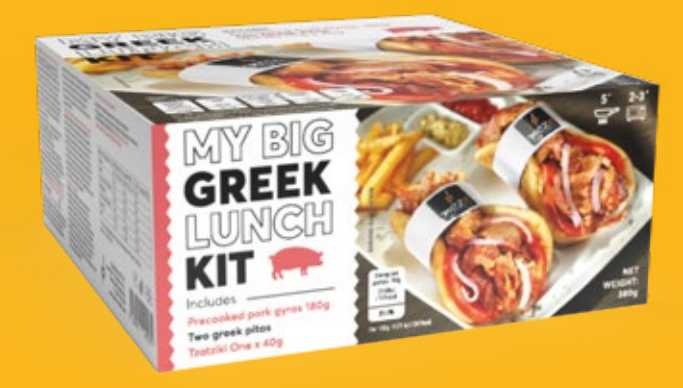
PRECOOKED PORK GYROS LUNCH KIT

Just follow the simplest instructions and eat like a greek!