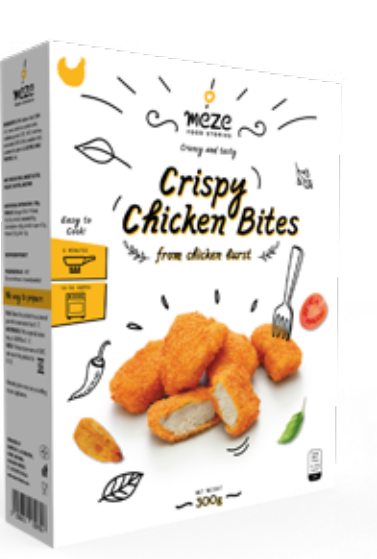
CRISPY CHICKEN BITES 300g