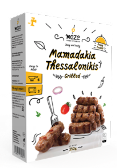
GRILLED MAMADAKIA THESSALONIKIS 350g