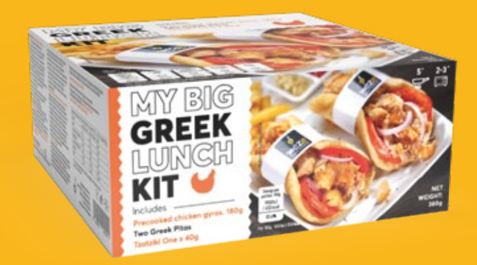
PRECOOKED CHICKEN GYROS