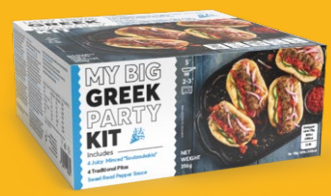
JUICY MINCED SOUTZOUKAKIA PARTY KIT

Convenient Kits with all the ingredients you need packed in a box!