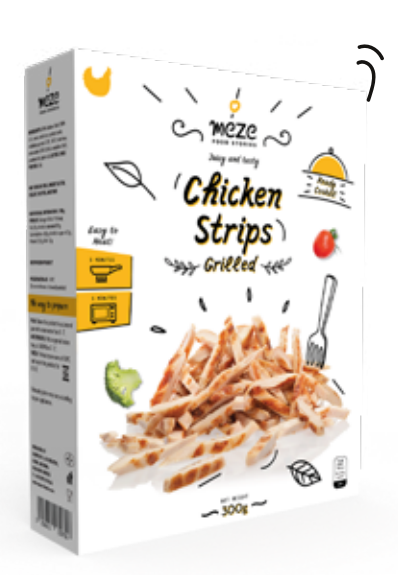
GRILLED CHICKEN STRIPS 300g