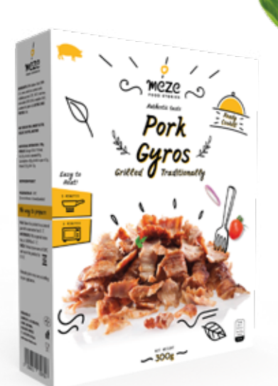
GRILLED PORK GYROS 300g