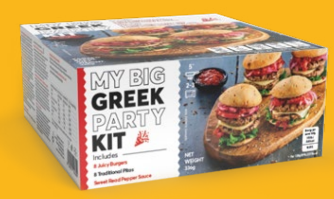
JUICY MINI BURGERS PARTY KIT